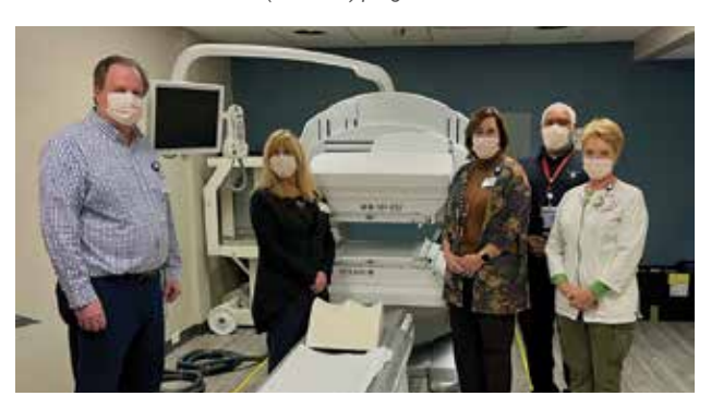
Los Alamos installed a new nuclear medicine camera.