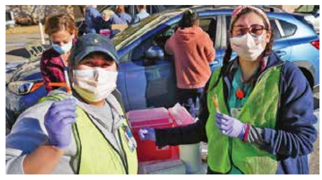
Team members at Los Alamos coordinated a drive thru flu shot clinic.